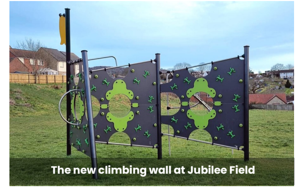
The new climbing wall at Jubilee Field

In 2022, Axminster Town Council was restored to our full complement of fifteen members, something which had not been the case for a number of years. The new Councillors have brought with them a wide range of skills, experiences, ideas and energy to make the town better and improve residents' lives. As a result, we have been able to complete lots of things that unfortunately had been put on hold. We are heartened that the community response to our efforts has been so positive, especially given the financial challenges we already face. 2022 was a very busy year and we have no doubt that 2023 will be even busier still!