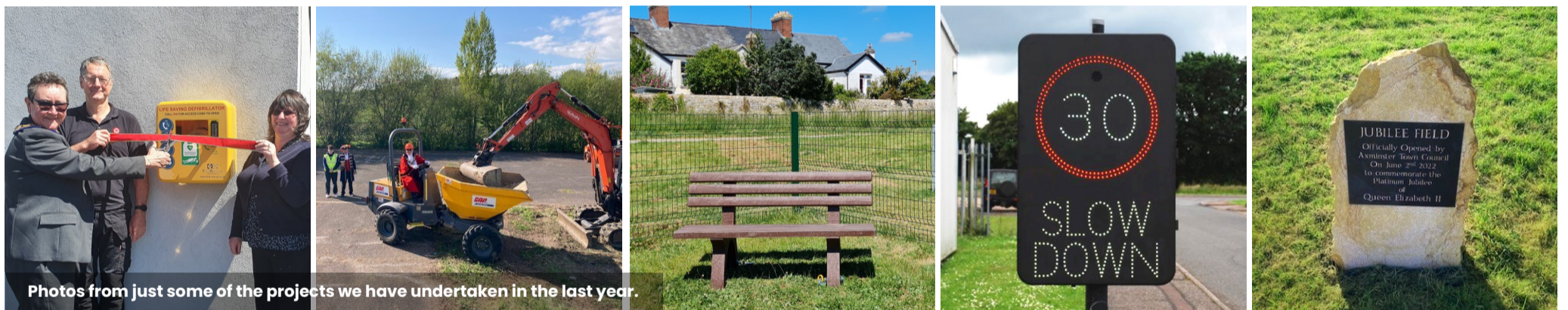
Photos from just some of the projects we have undertaken in the last year.

Be sure to check out what is coming up next at the Guildhall in 2023.