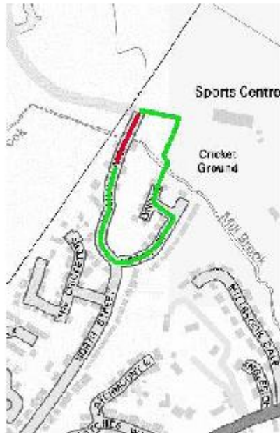
PEDESTRIAN DIVERSION ROUTE PICTURED ABOVE